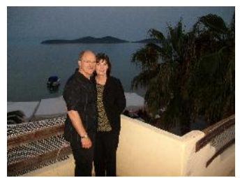
An evening by the sea in Greece